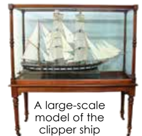
A large-scale model of the clipper ship 'Canterbury' . Achieved $3,500