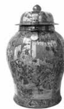
Lot 353 Chinese famille rose lidded jar