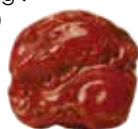
A finely carved 'palm' (fingering) piece in rich red lacquered amber Achieved $15,000