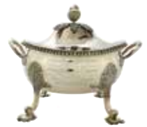
A rare and historically important George III lidded Scottish silver large tureen. Achieved $6,500