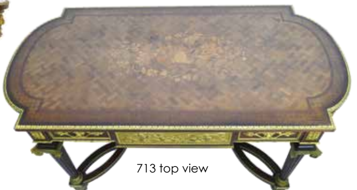
713 top view