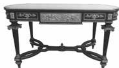
Lot 713 Bureau Plat