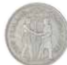
A rare N.Z. 1935 Waitangi Crown. Achieved $5,500