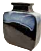
An impressive large Len Castle branch pot. Achieved $5,000