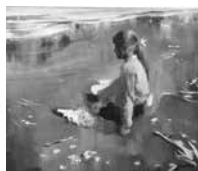
Lot 767 Peter McIntyre Oil