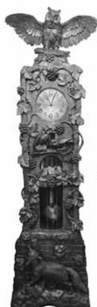
Lot 719 Black Forest Clock