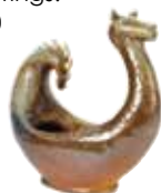
A good Barry Brickell salt glazed dog boat . Achieved $17,500